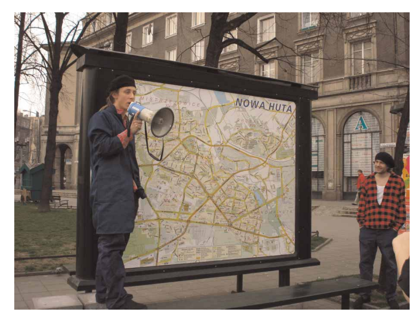
Figure 2. A guide with loudspeaker at Plac Centralny, Nowa Huta.

The second important site is the church 'The Lord's Ark' in Nowa Huta. As a giant symbol of resistance to the communist denial of religion, the workers literally erected the church as a medieval cathedral. It took the inhabitants of Nowa Huta 10 years to build the church with stones carried in bags from all over Poland. As the Lord's Ark was