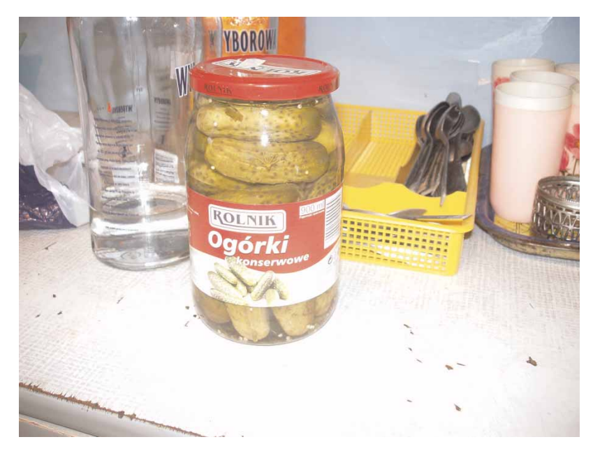
Figure 4. Cucumbers and Vodka in the kitchen of apartment 3, 12, Nowa Huta.