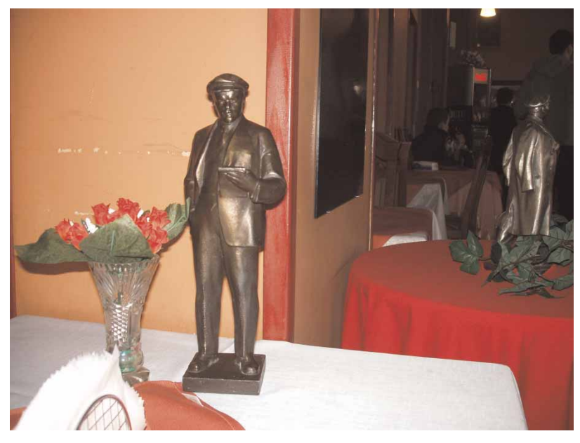
Figure 3. A small size Lenin statue in the Restaurant Stylowa, Nowa Huta.