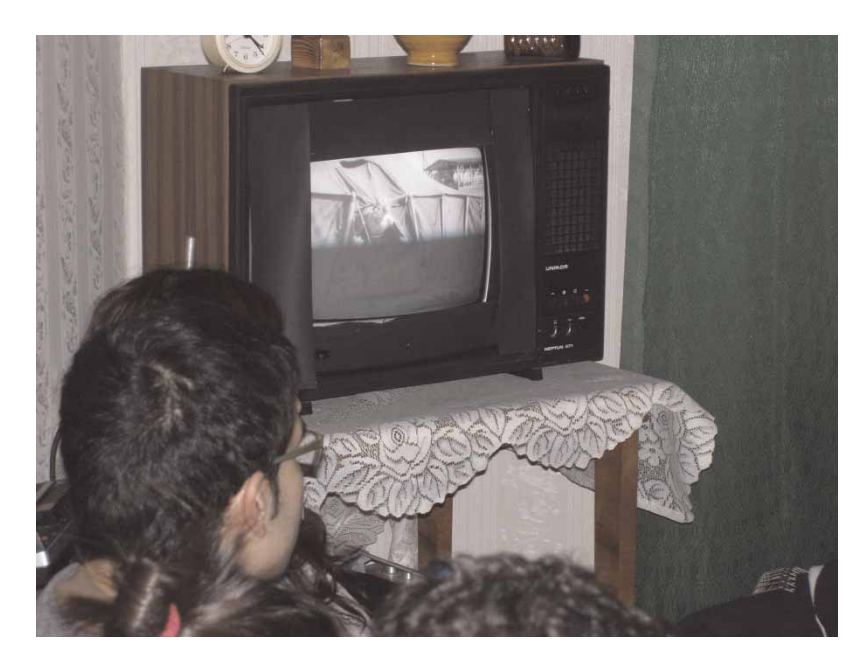
Figure 5. Italian student watches propaganda movie from 1951 in the living room of apartment 3, 12, Nowa Huta.