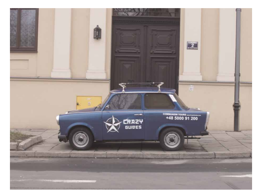
Figure 1. The characteristic ornamented vehicle from the communist past.

The Crazy Guides Communism Tours include four iconic 'live' sites and two immersive environments in which the aesthetic atmosphere (Böhme, 1993) is integral to instilling the feeling of the past in the tourist<sup>6</sup>. The four iconic sites in Nowa Huta are the central square,